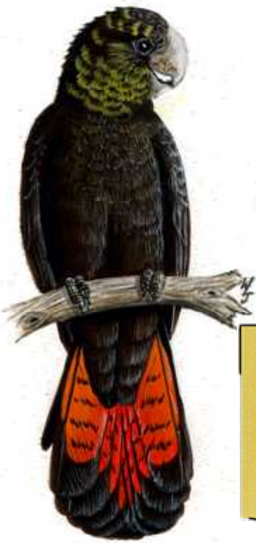
The Glossy Black Cockatoo (an endangered species) is common in the Pilliga Forest