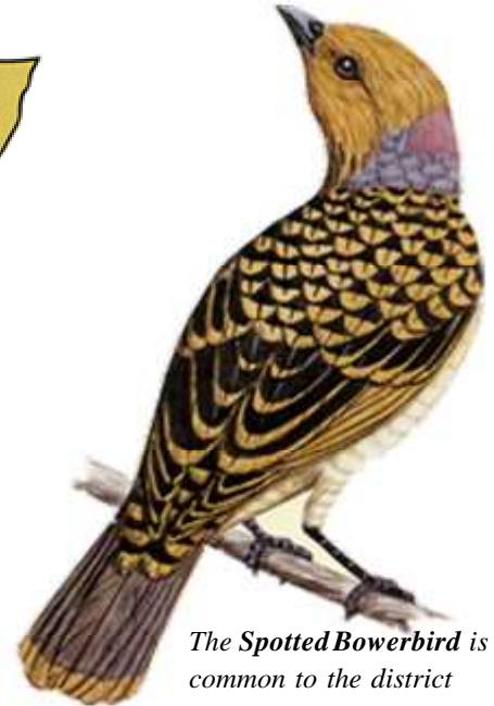
The Spotted Bowerbird is common to the district

Between the foothills of the Warrumbungle Mountains, the Great Western Plains and the vast forests of the Pilliga, lie a series of rewarding and readily accessible bird trails.